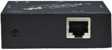
DVX-200 Pro TX Back