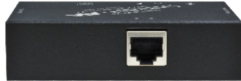
DVX-200 Pro RX Back