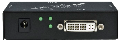
DVX-200 Pro RX Front