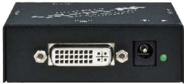
DVX-200 Pro TX Front