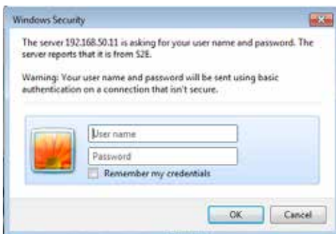
Figure 5-1: SmartAVI HDR-8X8 Plus Login Webpage

Enter the IP address in a browser of your choice and the Web Control login screen should appear as shown in figure 5-1.