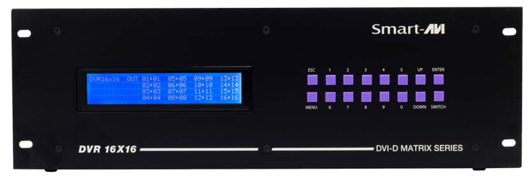
DVR 16x16 Front