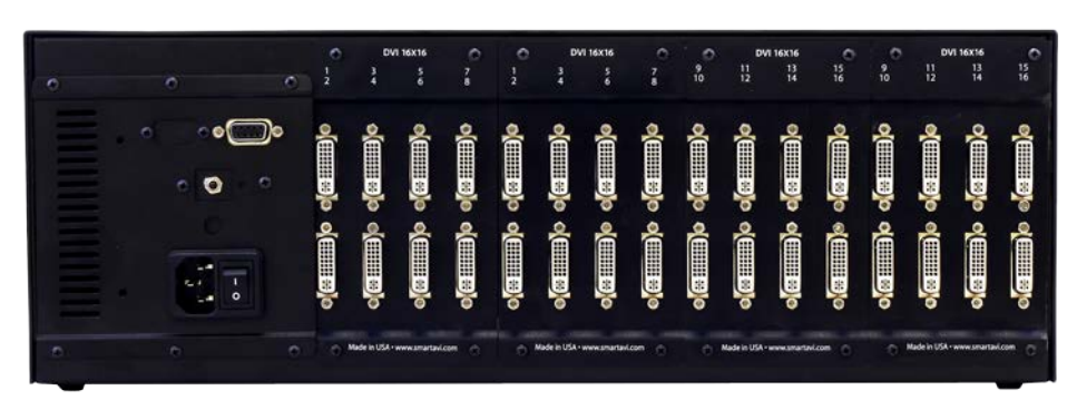
DVR 16x16 Back