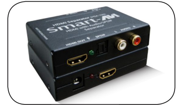
HDMI to HDMI with Audio/SPDIF Converter