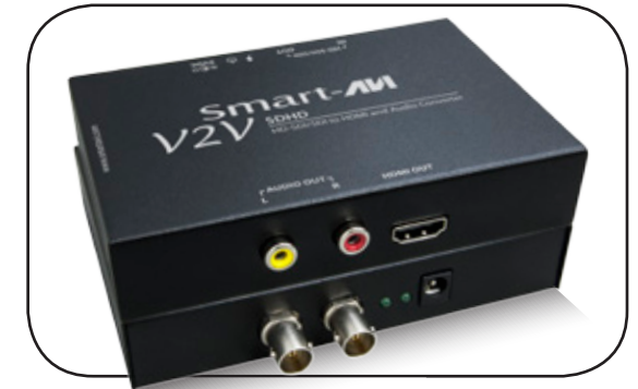
HD-SDI/SDI to HDMI and Audio Converter